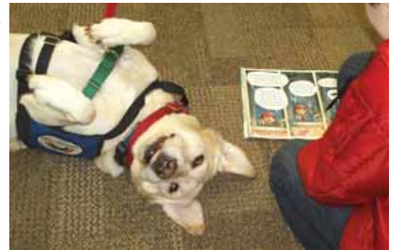
Niji, ears set for optimal listening, with a big smile on her face