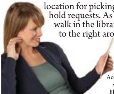
Access eBooks with your library card!

location for picking up hold requests. As you walk in the library, bear to the right around the