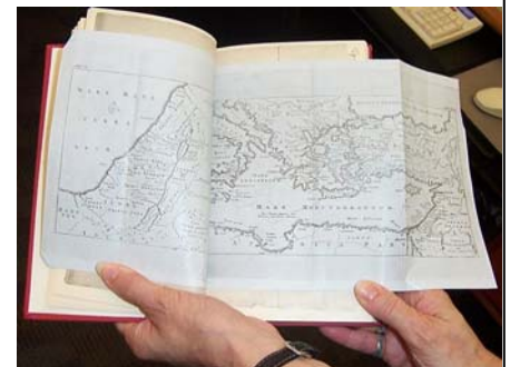
Jefferson inserted a map of the Holy Land

I’d like to be able to conclude this article by announcing that our slim little volume is worth enough money to balance the potential state funding cuts that we face this year; unfortunately, such is not the case. Nevertheless, not everything can be measured by simple monetary value and we are proud to have this early edition of Jefferson’s work in our Reference collection. Like all our materials, it belongs to the people of Abington Township. Come in and visit it sometime soon!