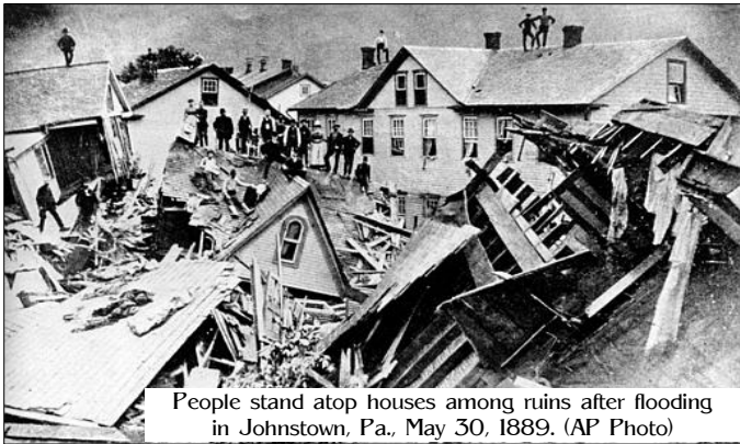
People stand atop houses among ruins after flooding in Johnstown, Pa., May 30, 1889. (AP Photo)

From: Johnstown Flood Museum- Flood Facts - jaha.org/flood/flood_facts.htm