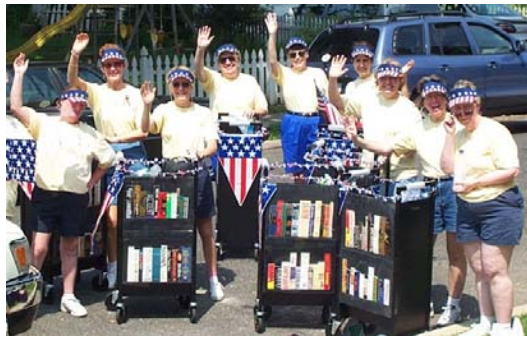
Hope you caught the Abington Book Cart Drill Team in Glenside's 100th 4th of July Parade! Catch the photos @ http://abg.mclinc.org

Hours Mon. 2-9 p.m., Tues., Thurs., Sat. 11 a.m.-5 p.m. Wed. 2-8 p.m., Fri. 2-5 p.m.