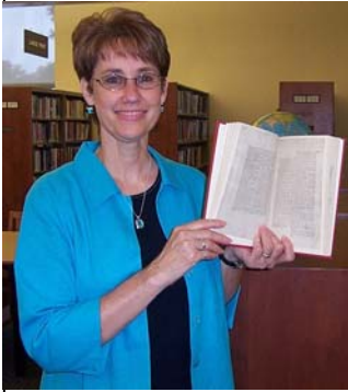
The author – of this article – shows her find.

Just as our backyard gardens require attention to keep their beautiful flowers from being choked by weeds, so, too, the library collection must be periodically “weeded” to eliminate old materials and give new materials room to “bloom.” A few months ago, as I was working my way through the religion section in an attempt to sort through the old, the worn, and the dated, I came upon an unusual find: a slim volume entitled The Life and Morals of Jesus of Nazareth .